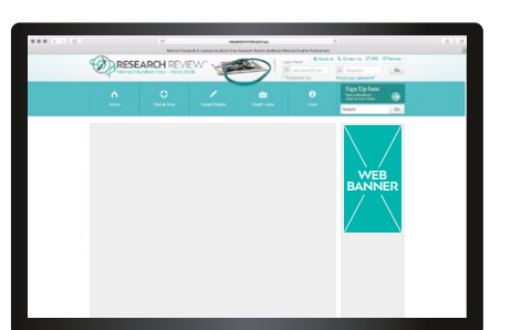
WEBSITE BANNER 170px(W) x 315px(H) @ 72dpi