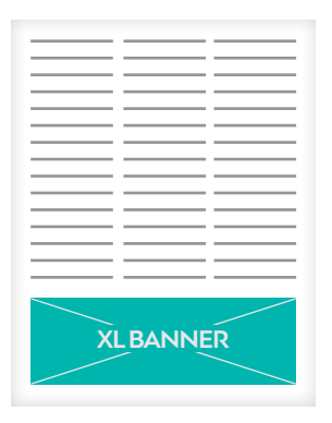
XL BANNER STRIP (NO BLEED) 190mm(W) x 67mm(H)